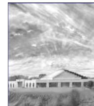
"Temple of ECK" Chanhassen, MN, USA